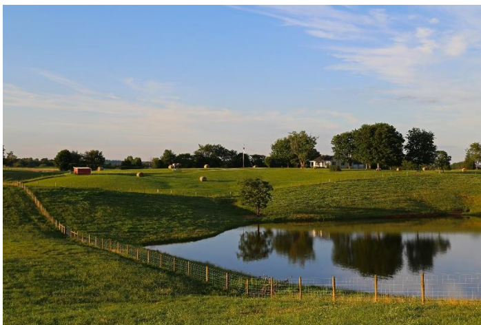
A Farm in the Mammoth Cave Biosphere Region.

What is the Mammoth Cave Biosphere Region? The Mammoth Cave Biosphere Region (MCBR) is an internationally recognized place where local residents, public and private sector organizations, and technical experts cooperate to maintain thriving communities while conserving our unique natural resources. Led by an Advisory Council, the Biosphere Region strives for clean groundwater for our people and our environment.