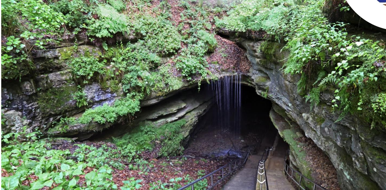
The Historic Entrance to Mammoth Cave.

What is the Mammoth Cave Biosphere Region? The Mammoth Cave Biosphere Region (MCBR) is an internationally recognized place where local residents, public and private sector organizations, and technical experts cooperate to maintain thriving communities while conserving our unique natural resources. Led by an Advisory Council, the Biosphere Region strives for clean groundwater for our people and our environment.